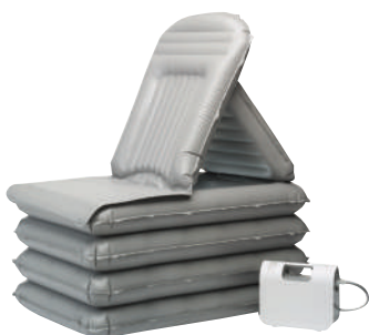
MANGAR Camel Lifting Cushion