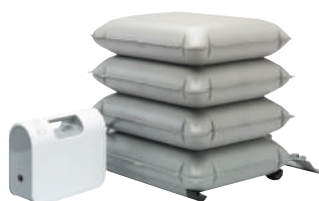
MANGAR ELK Lifting Cushion