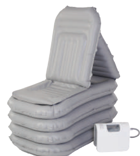
MANGAR Eagle Lifting Cushion